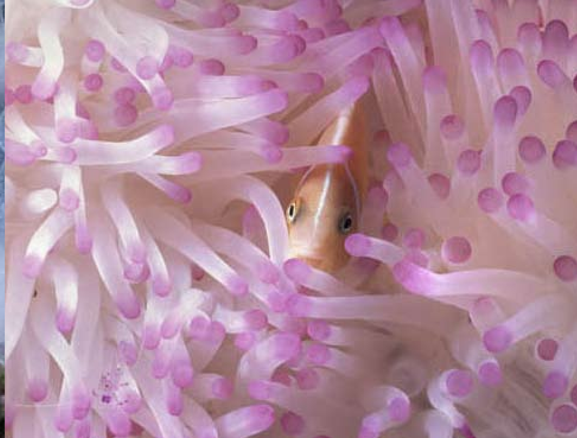
plate 60 SOLOMON ISLANDS

Anemone Fish in White Like all anemone fish, the red and black anemone fish ( Amphiprion melanopus ) live among the tentacles of an anemone ( Entacmaea quadricolor ) for protection. In return, the feisty fish keep dangerous intruders from nibbling on the anemone tentacles. This type of mutual help is a form of symbiosis. •RS, 50mm, two YS120