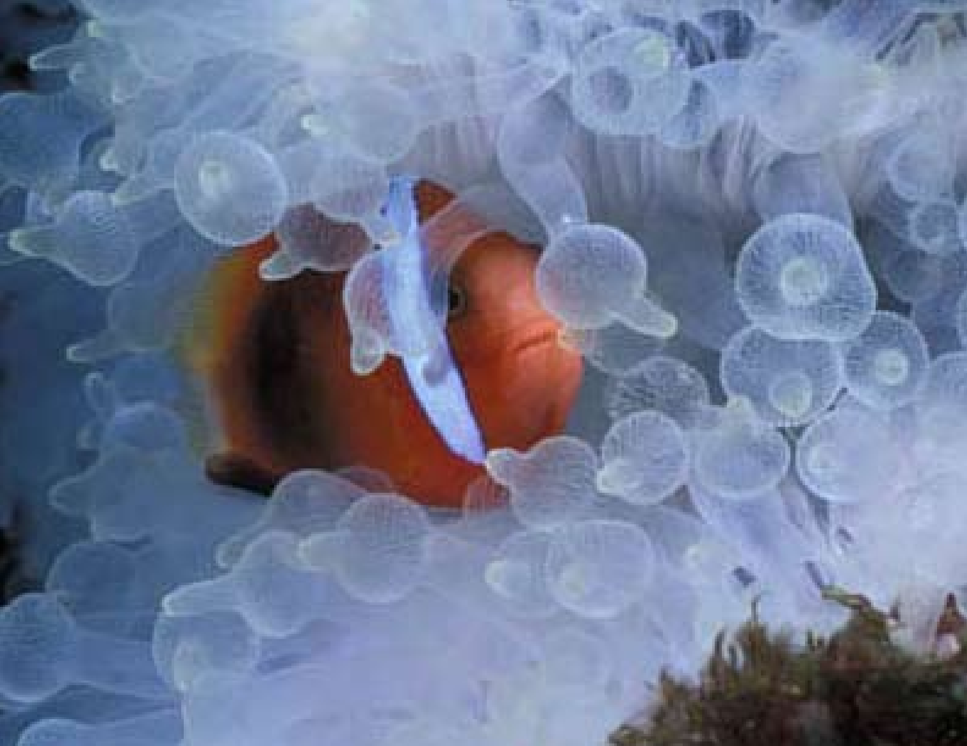
plate 59 SOLOMON ISLANDS

Anemone Fish in White Like all anemone fish, the red and black anemone fish ( Amphiprion melanopus ) live among the tentacles of an anemone ( Entacmaea quadricolor ) for protection. In return, the feisty fish keep dangerous intruders from nibbling on the anemone tentacles. This type of mutual help is a form of symbiosis. •RS, 50mm, two YS120